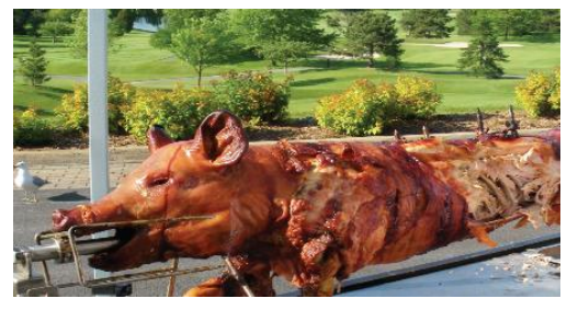
Catering your Wedding