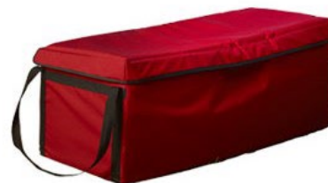
*insulated pig carry bag

(Must be returned clean) Based on availability - $50