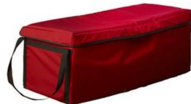
*insulated pig carry bag

(Must be returned clean) Based on availability - $40