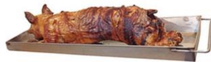
*roasted pig on handled meat tray